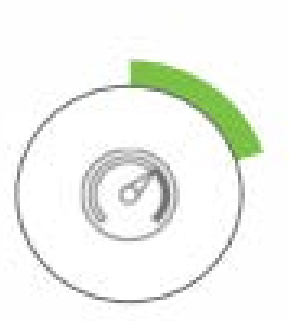
Smart Meter Installation